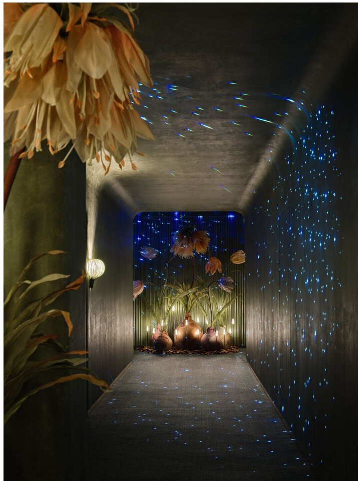
Green Massage in Mandang Road, by Vermilion Zhou Design

Do you know how Alice felt when she fell down the rabbit hole, right before entering the wonderland? This interior might be the perfect example. It gives to the viewer a sensorial experience, shrinking reality into a fantasy forest. This space is one that flourishes continuously, making you feel relaxed and curious, creating a desire inside our souls to explore all of the secrets that are hidden in this underground world.