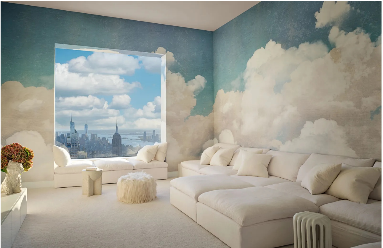
Apartment in Manhattan designed by Kelly Behur

You can't help but be mesmerized by this interior. The view is breath-taking, being even more highlighted by the wallpaper, which is continuing the story told by the window. This is an intriguing aspect of the interior: it makes you feel like you are surrounded by clouds, not by walls. You feel invincible and on top of the world. This room is the perfect example for cherishing the environment we are surrounded of and embrace its originality. During childhood, I think everybody had, at some point, the wish to fly or to touch the clouds. This design is calling back for our wishes from childhood, telling us that everything is possible.